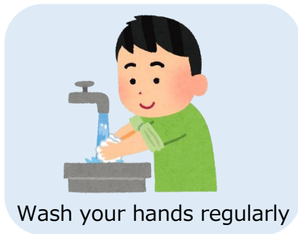
Wash your hands regularly