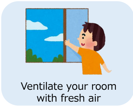
Ventilate your room with fresh air