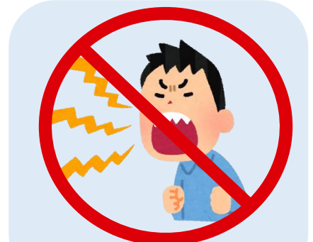
Refrain from speaking loudly