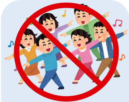
Avoid gathering as a crowd