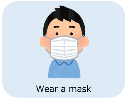
Wear a mask