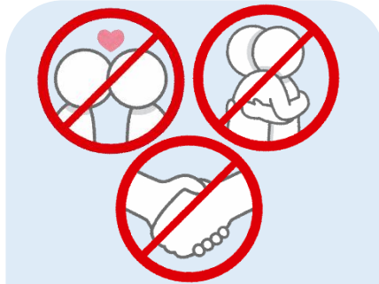
Be careful of kissing, hugging and shaking hands! They are risky!