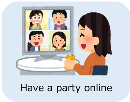
Have a party online