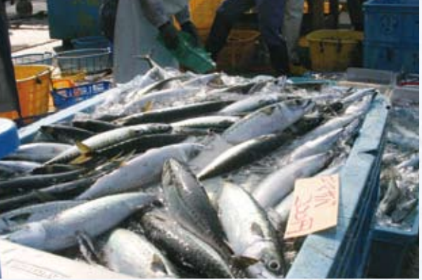
market offerings vary

Where: Summit of Mt. Takeyama / Mt. Takeyama Fudoin (武山不動院) When: January 28<sup>th</sup> (Fri) [Takeyama Sightseeing Association 046(856)3157]