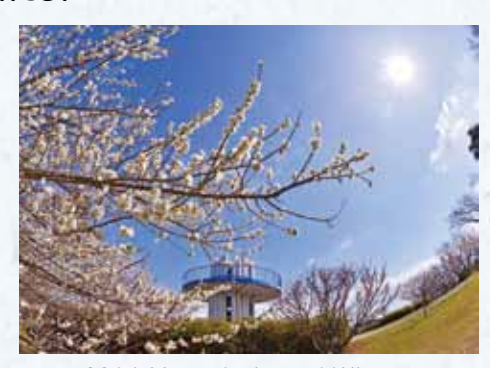
2014 Mayor's Award Winner

In conjunction with the festival, the Taura Tourism Association sponsors a photography contest. Any picture that depicts Taura's natural beauty, ruins, cultural treasures, sightseeing spots,