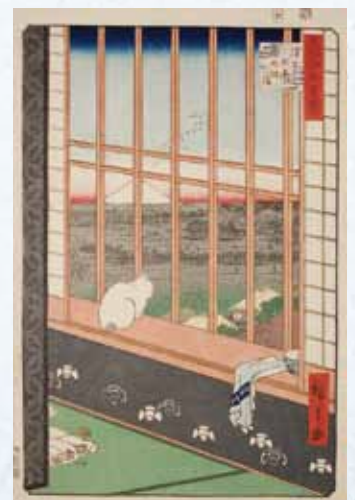
Utagawa Hiroshige's "Asakusa Rice Fields and Torinomachi Festival"