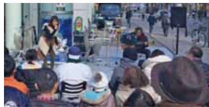
Yokosuka Machi-naka Music