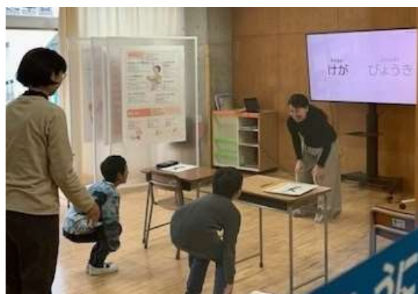
★ Intensive beginner Japanese course