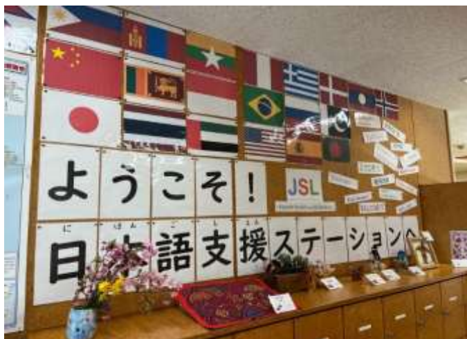
★Support Station entrance