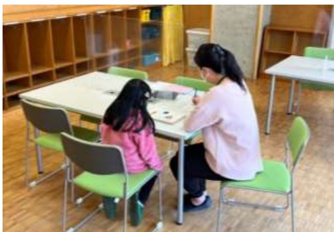
★Japanese language assessment test